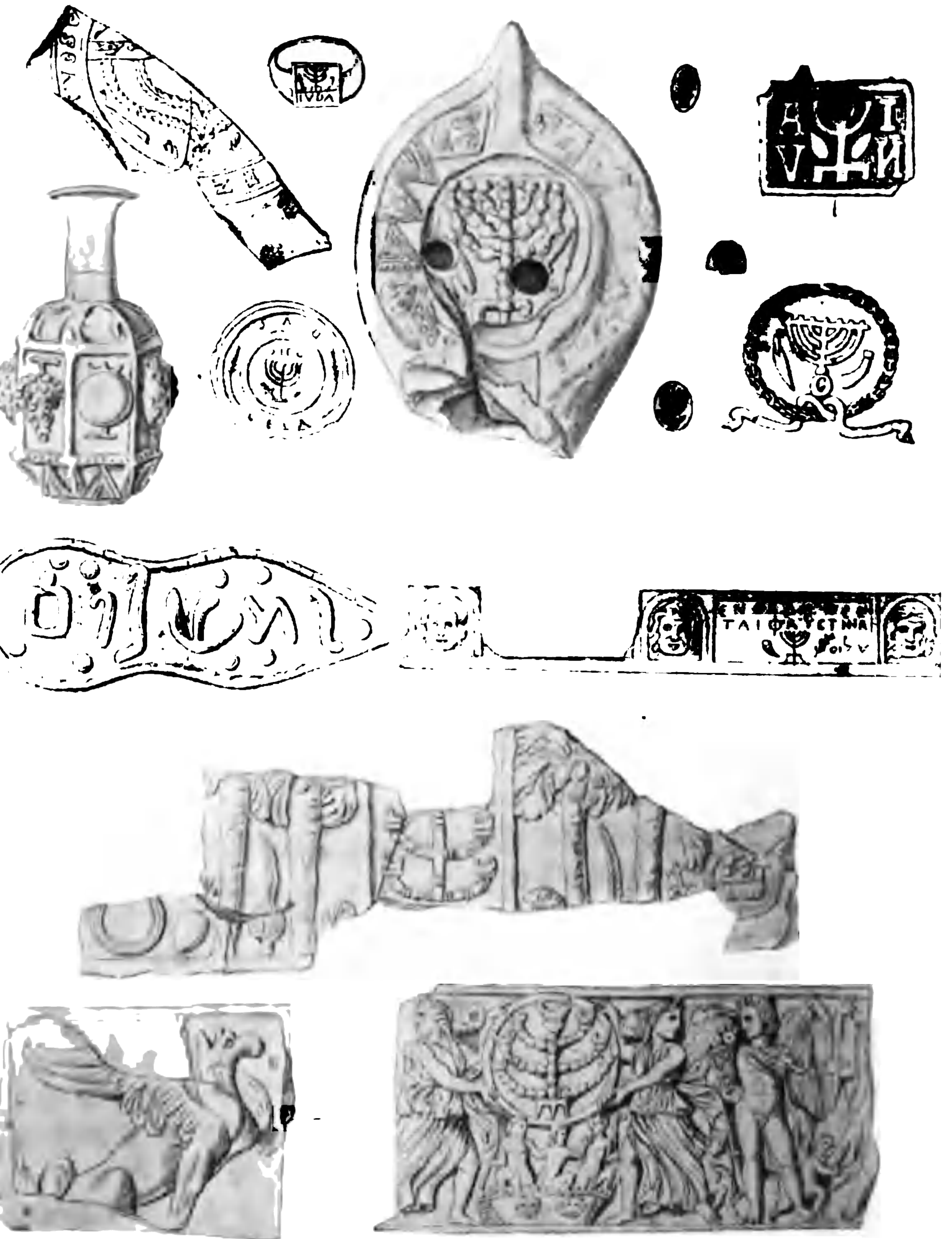
SYMBOLS AND INSCRIPTIONS FROM JEWELRY (From )