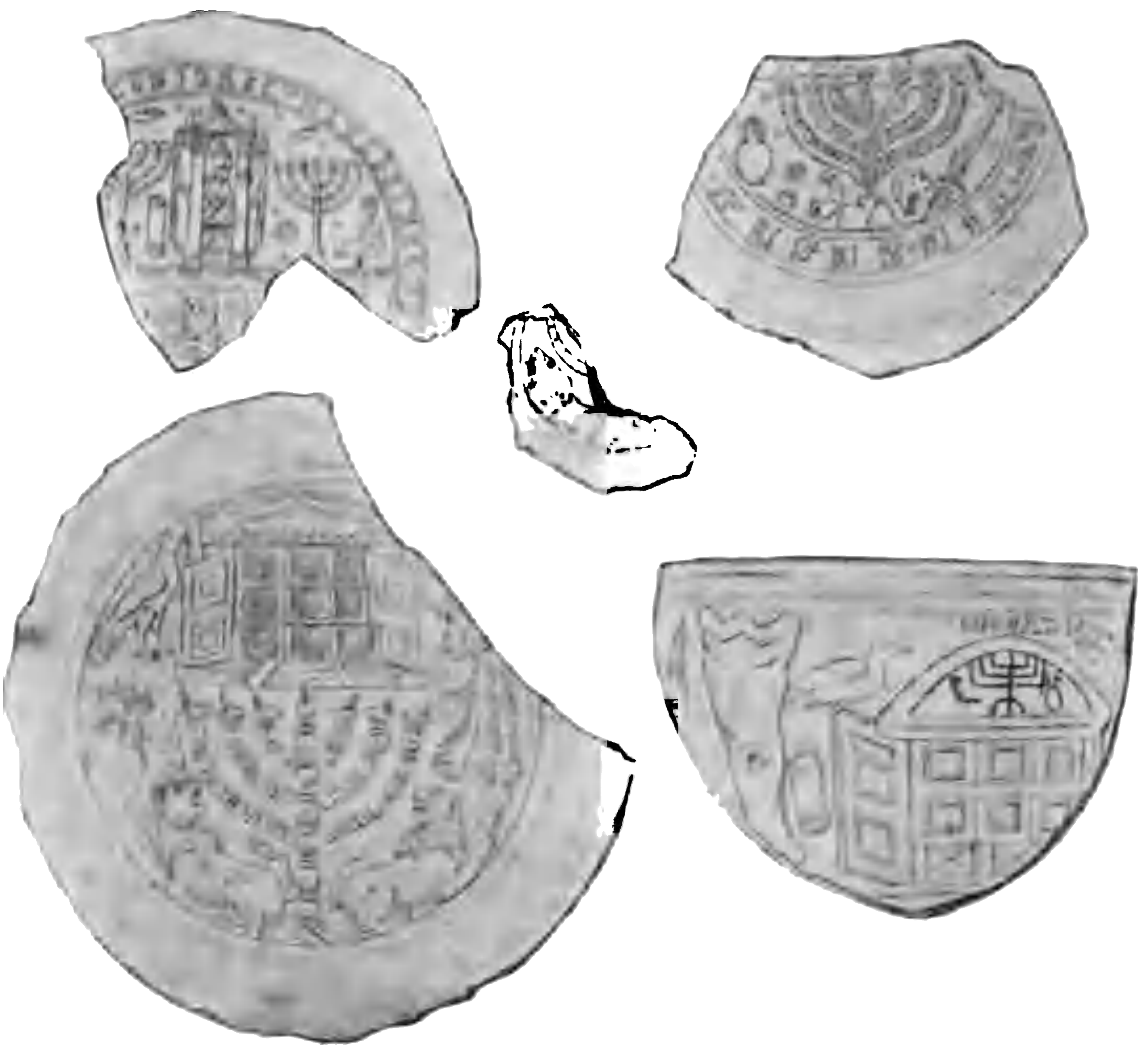
TACOMBS AND CEMETERIES IN ROME 1)