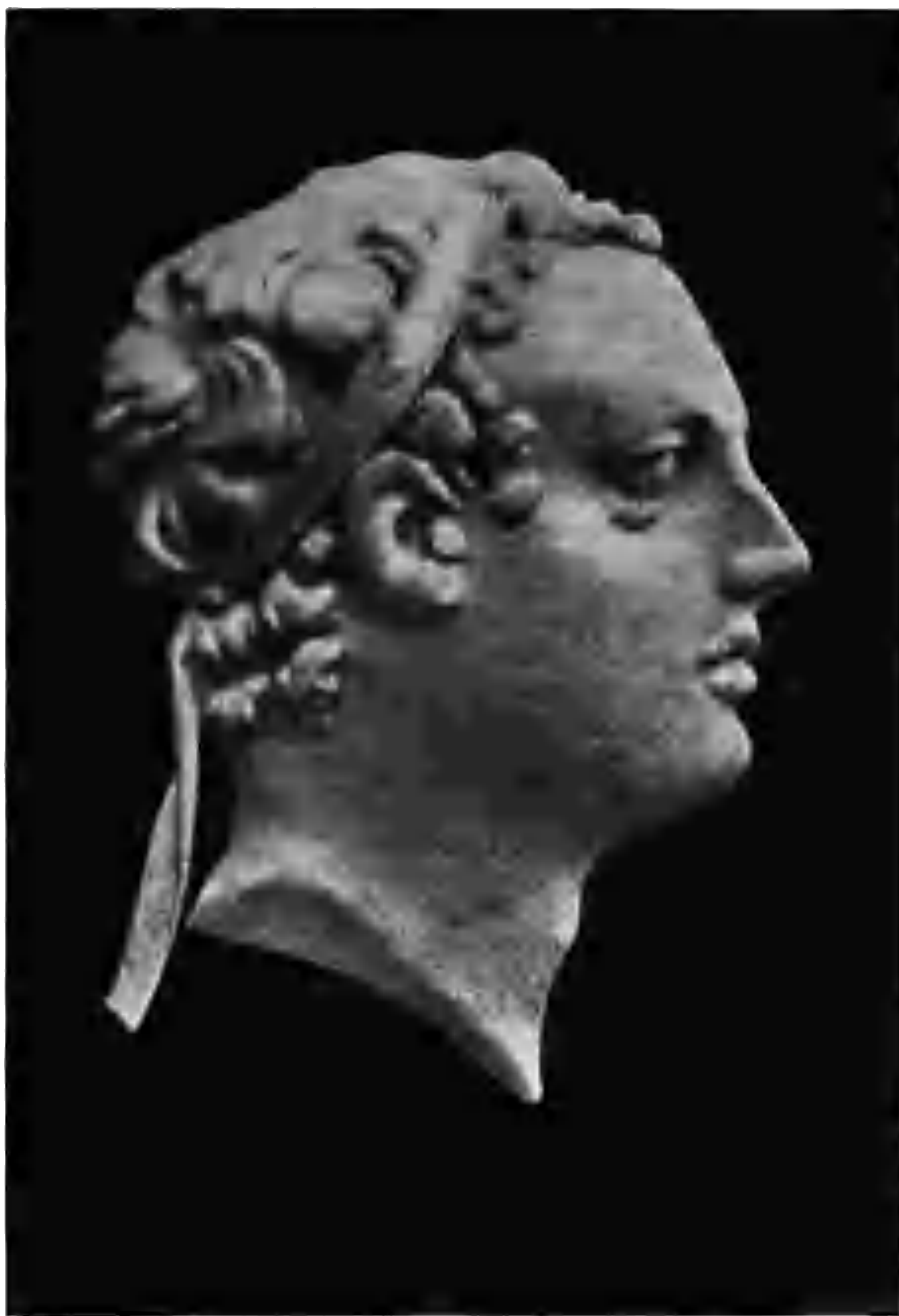
ANTIOCHUS (IV) EPIPHANES AFTER A COIN (From a drawing by Ralph Ilgan)