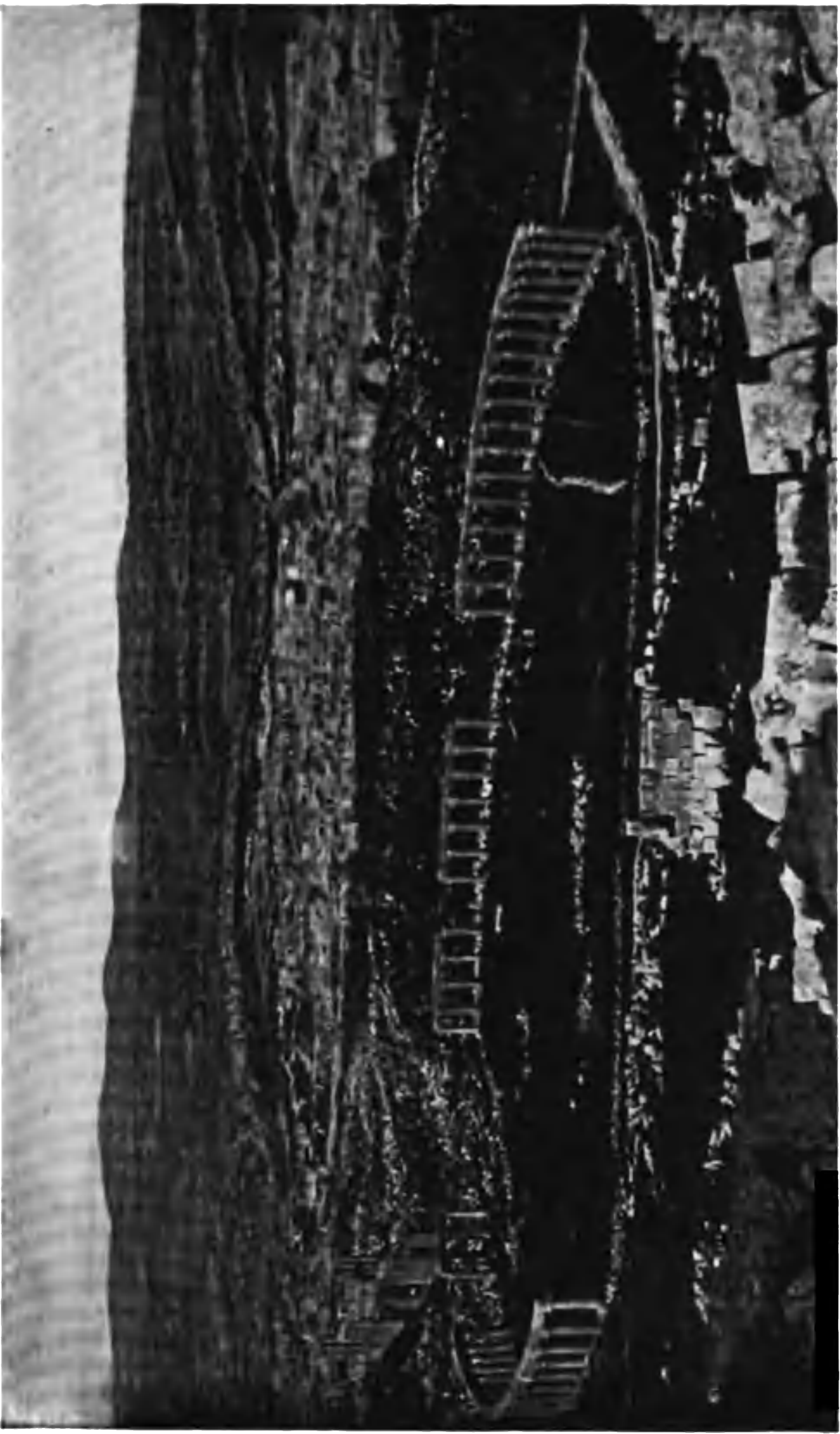
(e. Underscored and Underlined)