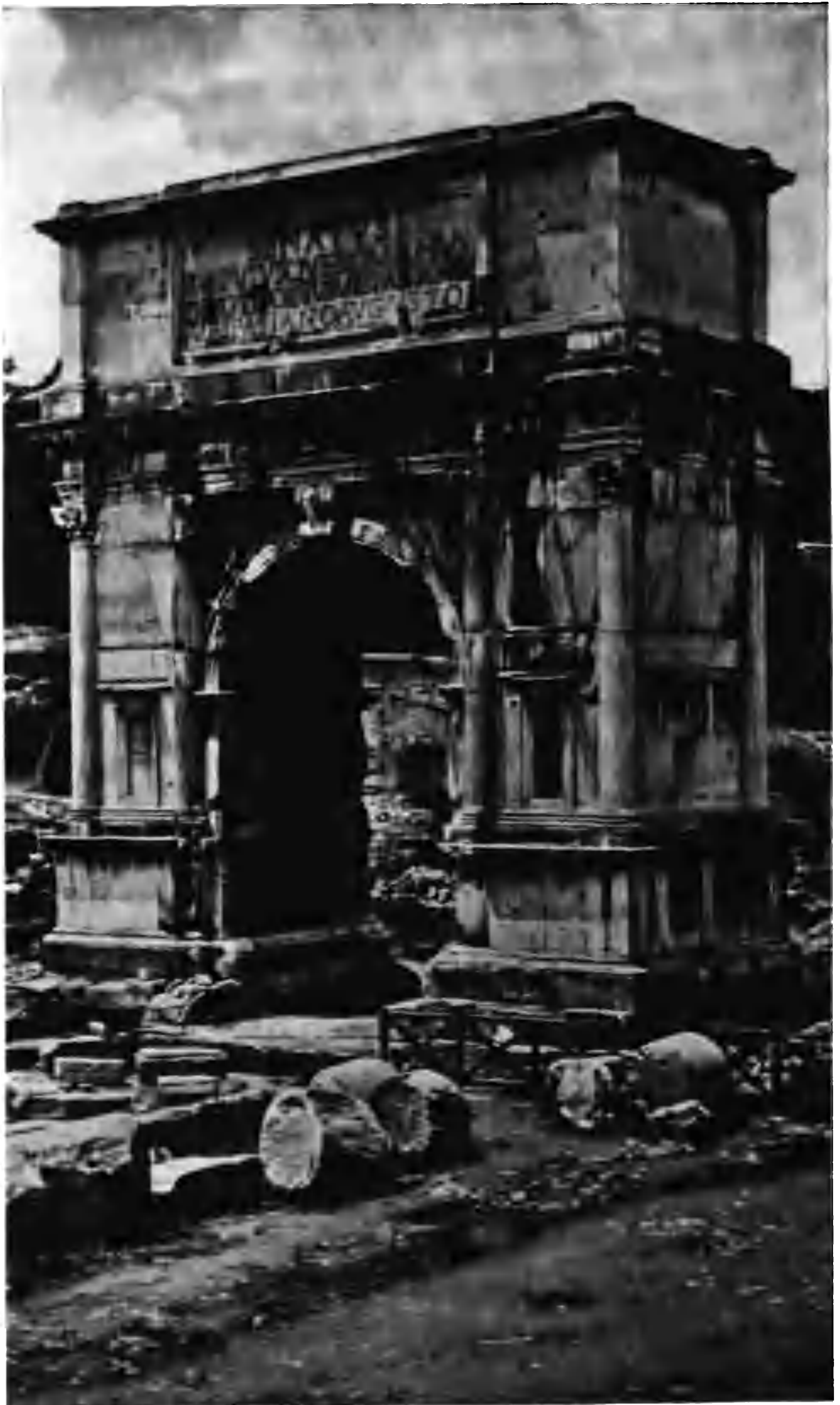
ARCH OF TITUS, ROME